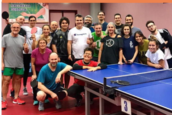
Course for adults