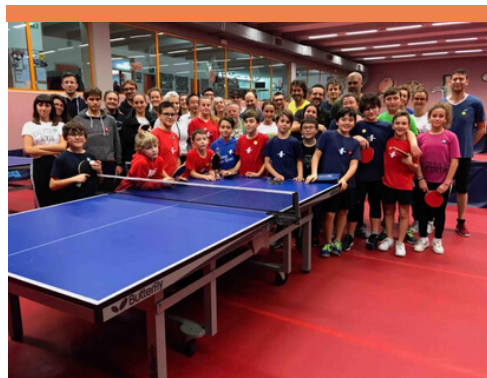
Course for beginners