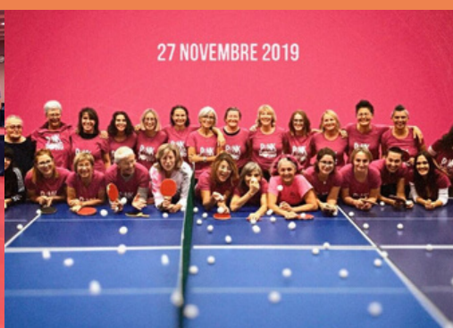
Event Pink Pong