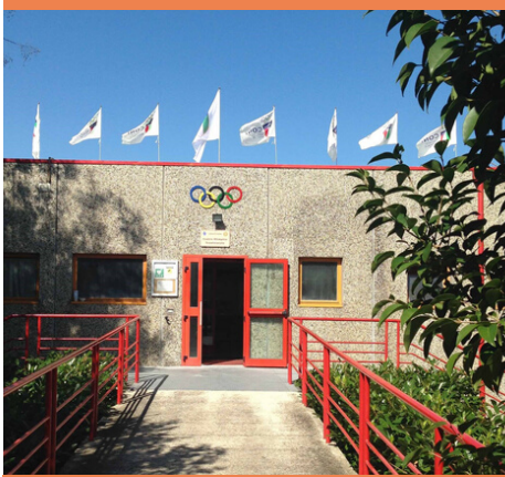
The main building of the Centre