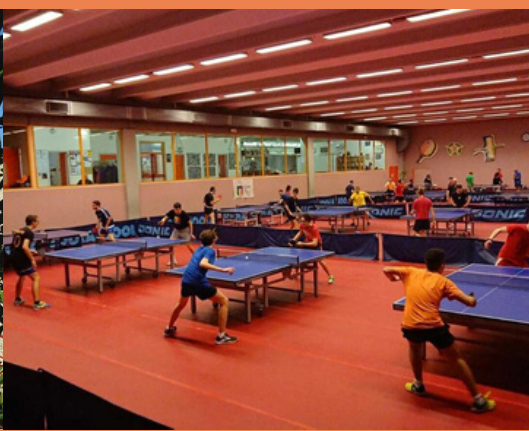
Table Tennis course for children